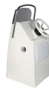
Optima 800 FTC console