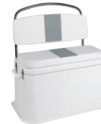
T4 locker seat

PACKS ARE OFFERED FOR ALL MODELS. SEE YOUR AGENT FOR DETAILS.