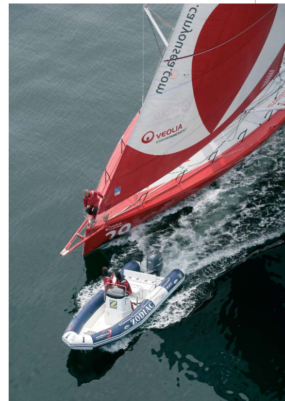
Limited series Pro Open Vendée Globe and Roland Jourdain on Veolia Environnement

Roland Jourdain, at the helm of his Véolia Environnement boat, also chose to team up with Zodiac™, in 2009, sharing the same notion of commitment and high performance standards. In this same spirit, Zodiac™ is also the official supplier in 2010 of the Route du Rhum™ – La Banque Postale and will provide specific boats for the start of the race in Saint-Malo.