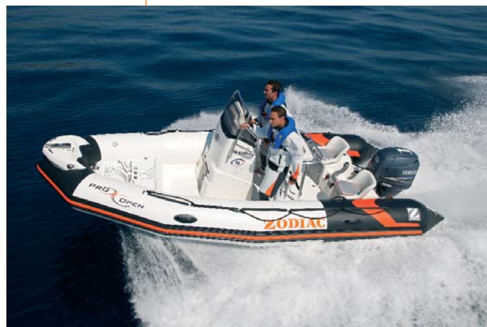
Limited series Pro Open Route du Rhum™ - La Banque Postale

In recent years, Zodiac™ has been keen to associate itself with the most prestigious sailing events by offering boats to ensure the safety of the competitors at the start and finish line of the most famous oceanic races. As partner of the Vendée Globe 2008/2009, Zodiac™ provided the Organizers with sixty Pro Open 650 boats to allow the skippers to navigate in a perfectly safe space of water despite the huge fleet of accompanying boats.