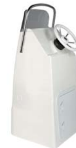
Optima 1000 console