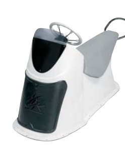
Two-seater jockey console