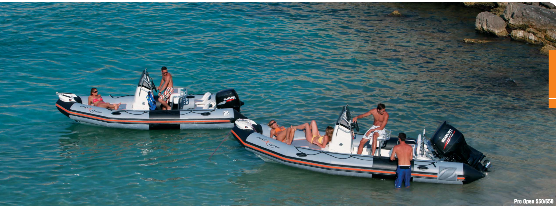
Pro Open 550/650