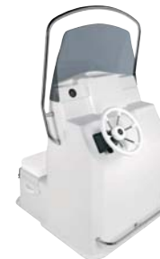
T4 console seat