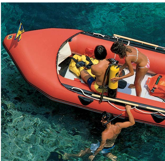
Zodiac™ Mark™ II

In 2010, the English magazine ‘Motor Boat’ awarded the Oscar for the best motor boat to our latest invention, the N-ZO™, adding to an already long list of trophies and awards.