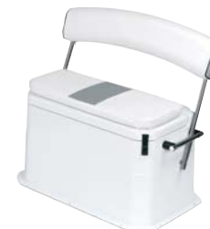
T4 folding seat