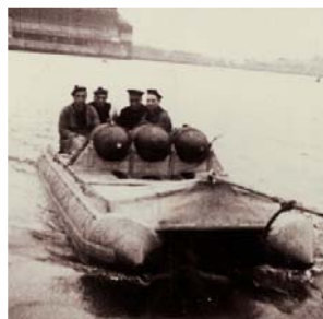
Prototype for the French navy (1937)