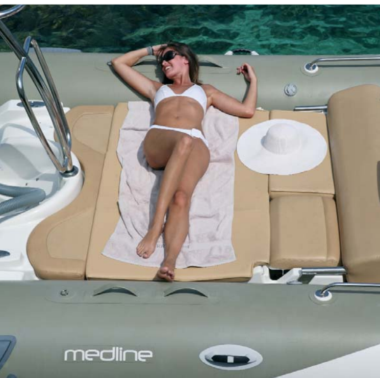
Sundeck 2010 (Medline™ 650)