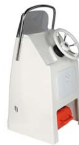
Optima 800 console

T4 Console seat + T4 Bolster + T4 locker seat + aft trough seat