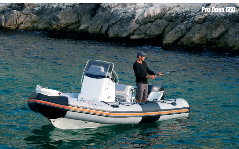
Pro Open 550