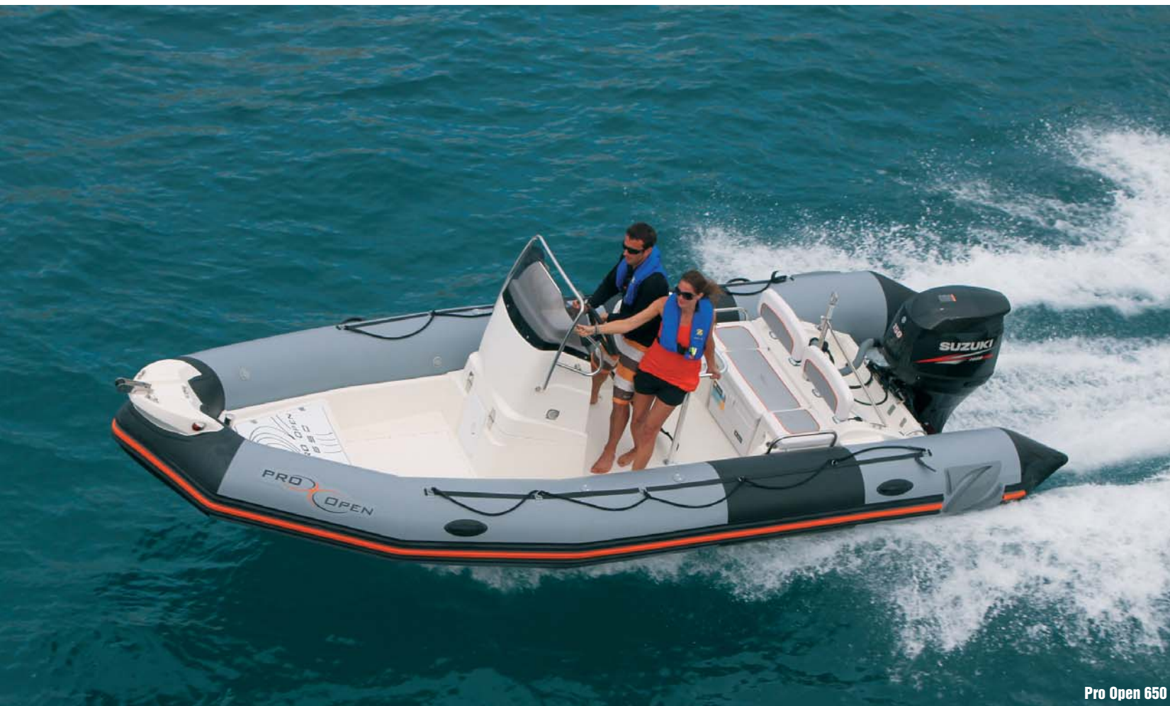
Pro Open 650