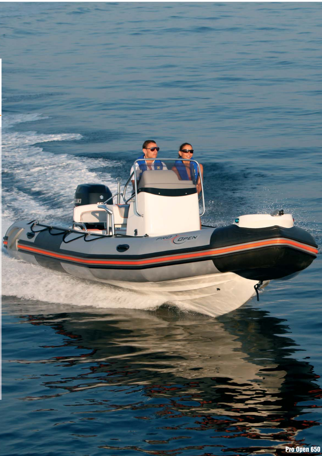
Pro Open 650